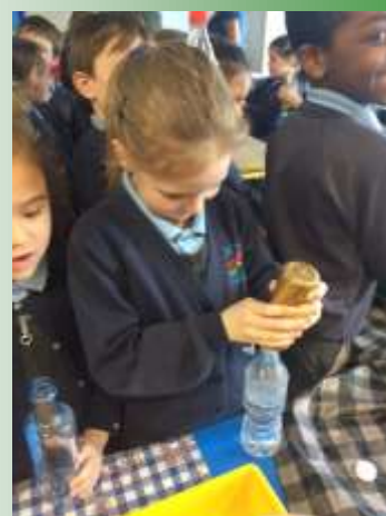
Mindfulness glitter jars