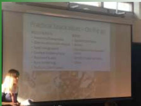
Katharine Tate on practical, nutritious snacks